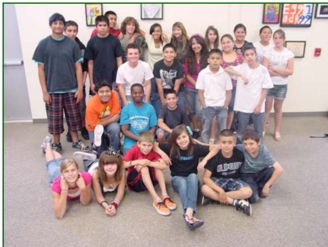
Bales Elementary School Youth4Youth Team

Their hard work and commitment allows this Y4Y team the opportunity to promote their message throughout Bales Elementary School beginning next school year: