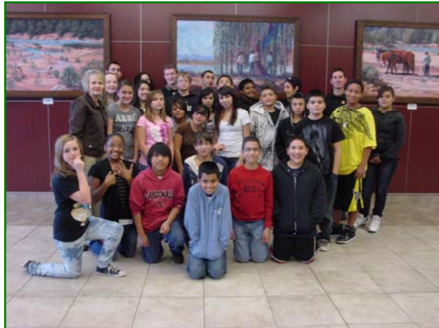
Buckeye Elementary School Youth4Youth Team

Their hard work and commitment allows this Y4Y team the opportunity to promote their message throughout Buckeye Elementary School beginning next school year.