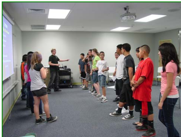
Students having fun learning and creating positive ways to impact their school.